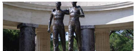
Bronze Statue, “Two Brothers in Arms,” at Sicily-Rome American Cemetery, Nettuno, Italy.

By the way, if you or anyone you know has a family member interred in an American cemetery overseas, do check out the ABMC Web site ( http://www.abmc.gov ). The site has proved helpful many times in the writing of our veteran biographies and has recently undergone substantial revision. In addition to data regarding veterans interred, it provides a virtual tour of each of the cemeteries and includes directions for accessing them if you have occasion to visit in person.