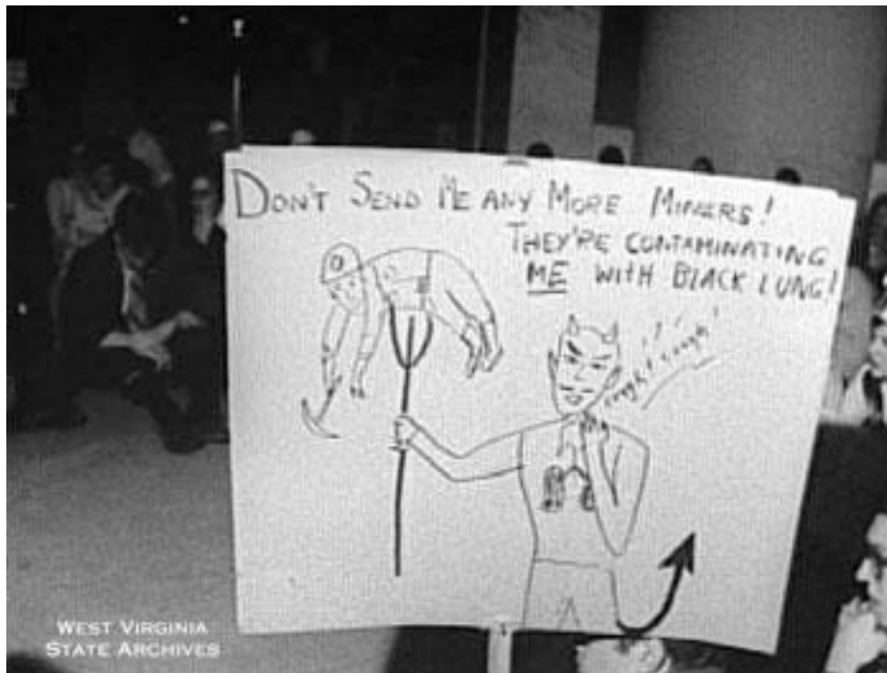
News footage of black lung rally, 1969

On February 18, 1969, UMW coal miners went on strike to protest the absence of black lung benefits.