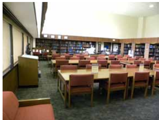
Above is a view of the recently redecorated library; at left are scenes of the June work.