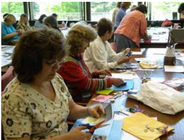
Participants in the May 2009 scrapbooking workshop.

In addition to offering workshops in the library, several staff participated in the Mid-Atlantic Regional Archives Conference in April: two staff assisted with local arrangements for the conference, two others gave a presentation on Archives and History's outreach to West Virginia students, particularly as related to its Web site, and another staff member discussed West Virginia statehood and the upcoming sesquicentennial celebration.