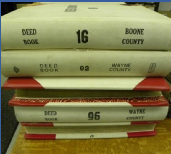
Deed books from various West Virginia counties

THE BOARD WILL BEGIN REVIEWING APPLICATIONS IN JANUARY AND THE GRANT WILL RUN CONCURRENT WITH THE STATE FISCAL YEAR (JULY 2025-JUNE 2026)