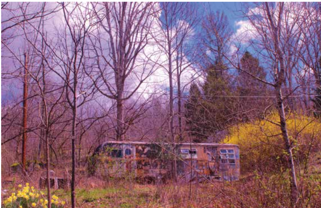
Below: Alice-Gervais Sabatino, Elkins, Randolph County Ellenboro in the Spring, Photography