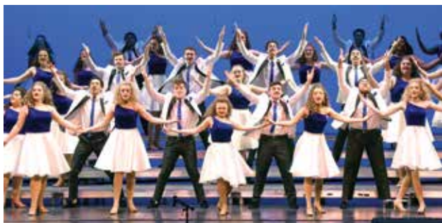
Capital High School's Voices of Perfection perform at the Governor's Arts Awards.

Nineteen awards recognized outstanding achievements in the arts by individual artists, organizations, and legislators.