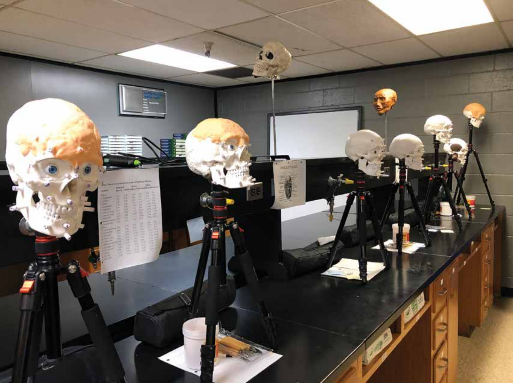
Above and opposite: Advanced forensic science students at Midland Trail High School (Fayette County) create detailed models while learning about facial reconstruction.

for students. Students create art projects using Sphero Robots.