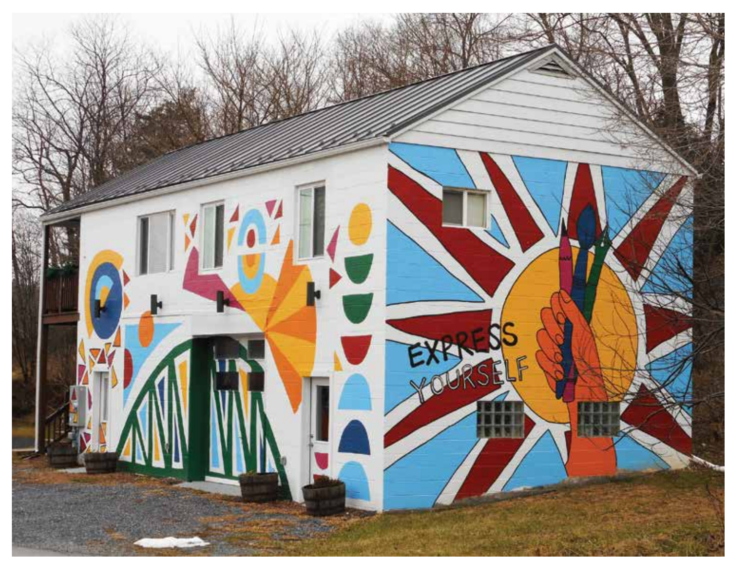
Volunteers from ages 4 to 74 helped paint Jenn Lockwood's largest mural in Capon Bridge.