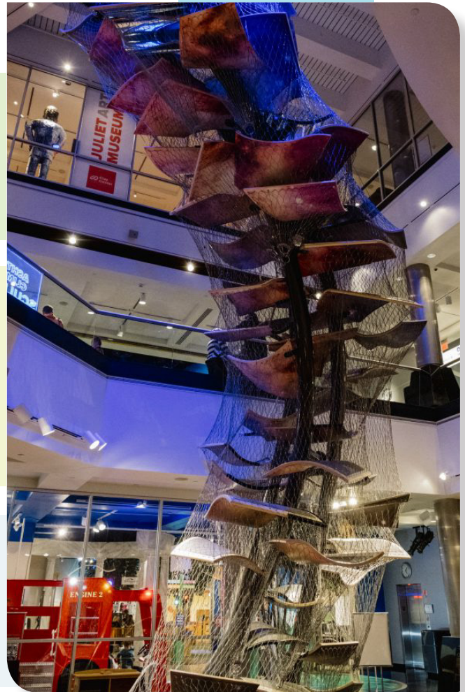
Ashton's Climbing Sculpture at The Clay Center for the Arts and Sciences.