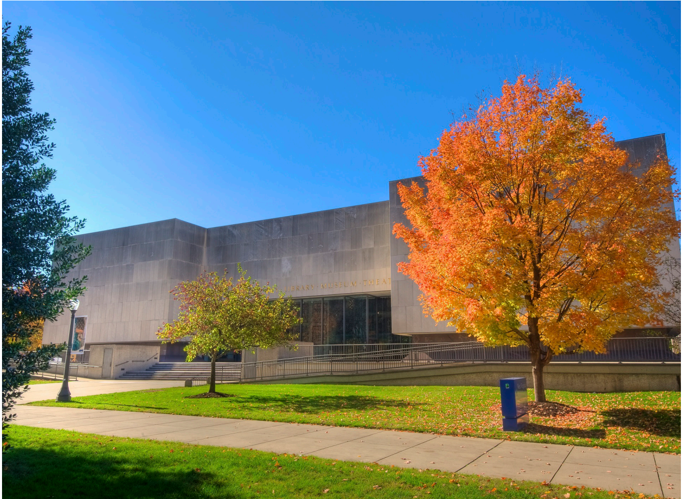
The Culture Center, Charleston