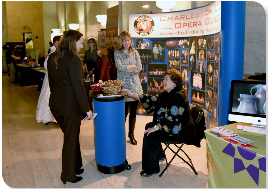
Charleston Light Opera Guild representatives talk with legislators at Arts Day at the Capitol.