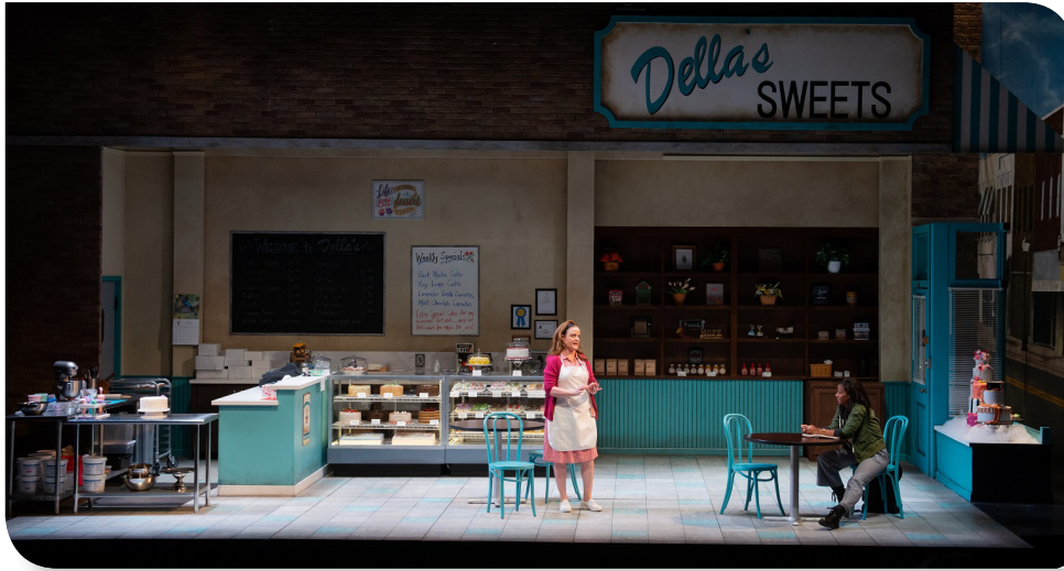
The Cake by Bekah Brunstetter, a comedic play produced at the Contemporary American Theater Festival in Shepherdstown.