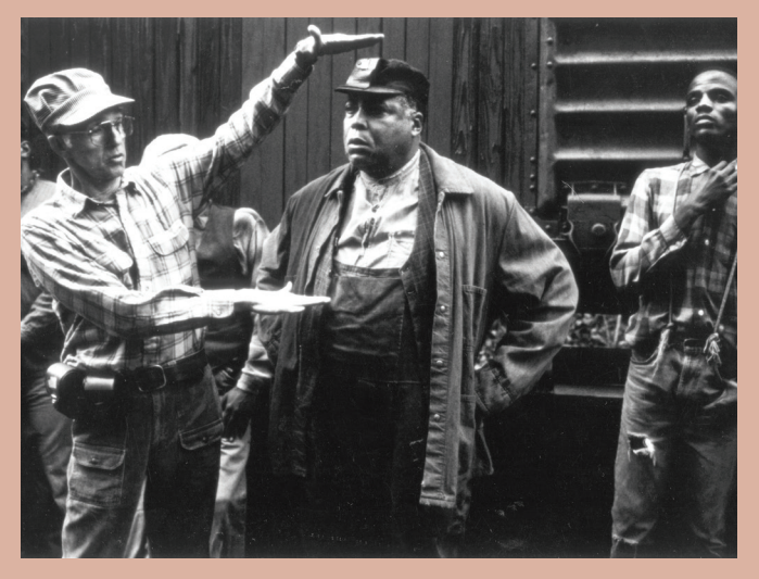
Two of the greats: cinematographer Haskell Wexler works with actor James Earl Jones.

Then, there were certain film tricks (before modern CGI) that take viewers back in time. Sayles and Wexler eschewed a couple common techniques for historical films, such as shooting in black and white or in sepia. They wanted it to look gritty but real. Sayles notes, "We didn't want to do that with film grain, like shoot in 16-millimeter, and have it look like it was shot with an old-time documentary camera. So, [Wexler] put a couple of . . . neutral density filters in, which takes a little bit