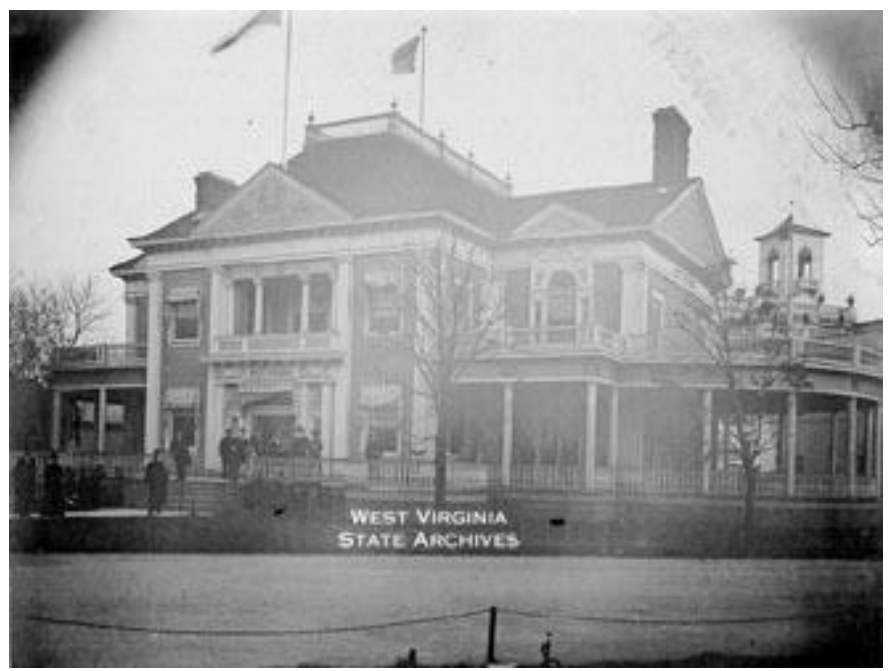
West Virginia State Building, World's Columbian Exposition of 1893

On March 14, 1891, the Legislature passed an act establishing a commission to organize the West Virginia exhibit at the World's Columbian Exposition of 1893.