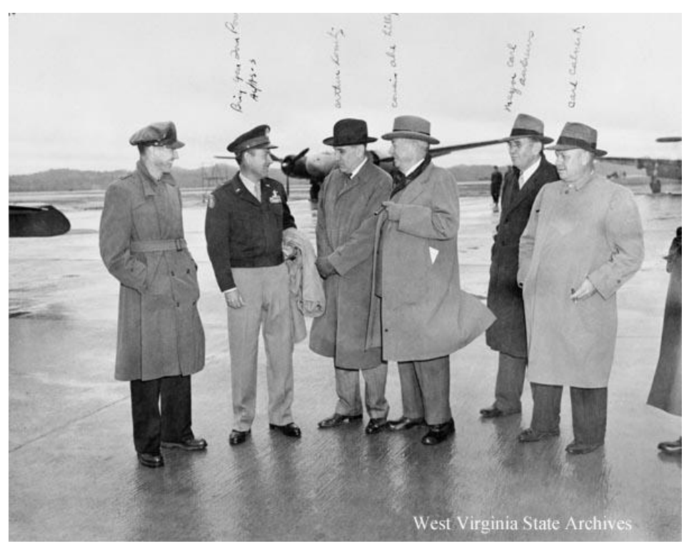
Dedication of Kanawha Airport, 3 November 1947

The Kanawha Airport in Charleston, now known as Yeager Airport, was dedicated on November 3, 1947.