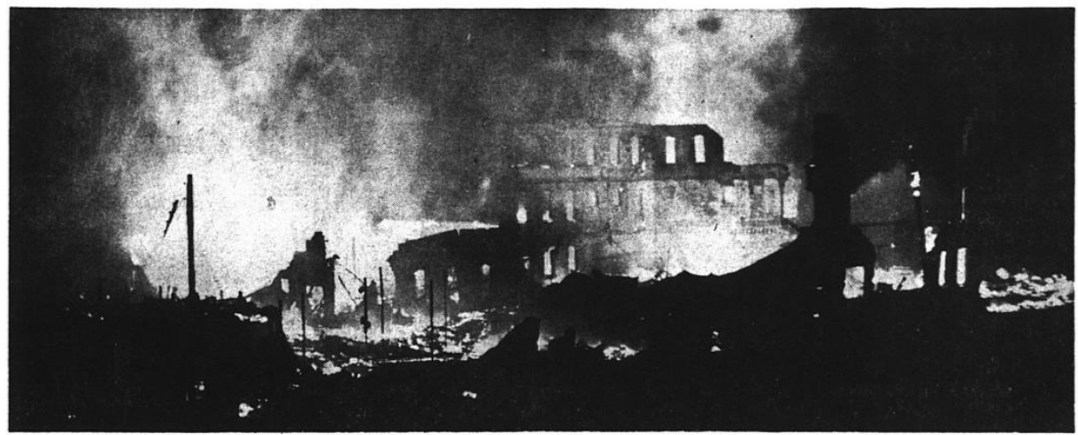
Flames lick at the remains of the Cameron Clay Products plant as night fell over the destroyed building.