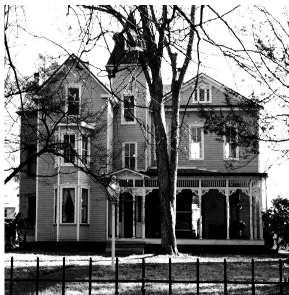
Brown-Shugart House, Jefferson County

In 2008, the West Virginia Division of Culture and History officially opened a new state-of-theart archaeological collections management facility at the Grave Creek site in Moundsville. The $3.1