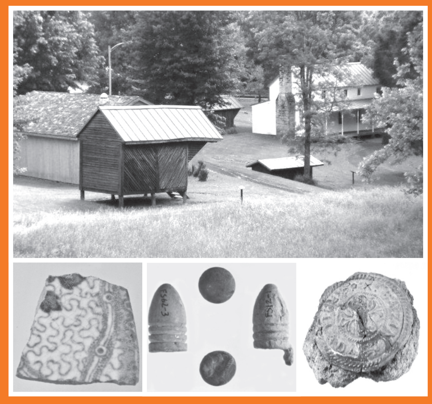
Bulltown Historic Area and artifacts (Ceramic shard, left; Ammunition, center; Bottle seal, right).

A Newsletter from the West Virginia State Historic Preservation Office West Virginia Division of Culture and History