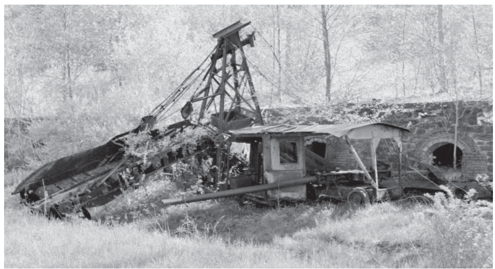
Coke Oven and Equipment - Bretz, Tucker County