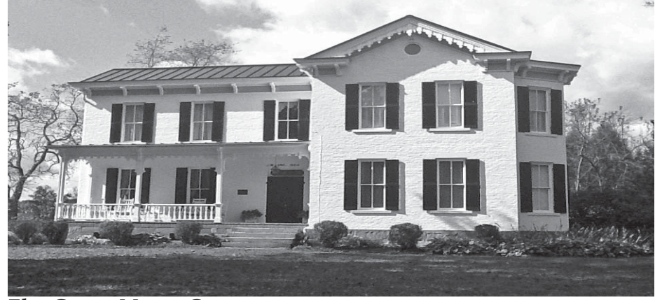
Elm Grove, Mason County

Using Geothermal Heating in a Historic House