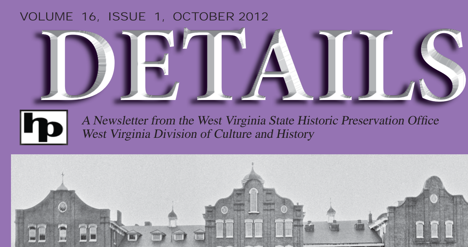
Mount de Chantal, Wheeling. (Left) Art Studio Students, 1950. (Right) Students in bedroom, c.1959.