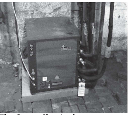
Elm Grove - Showing heat pump

At its January 27, 2012 meeting, the West Virginia Archives and History Commission awarded the FY 2012 survey and planning grants. These grants are funded through the annual Historic Preservation Fund