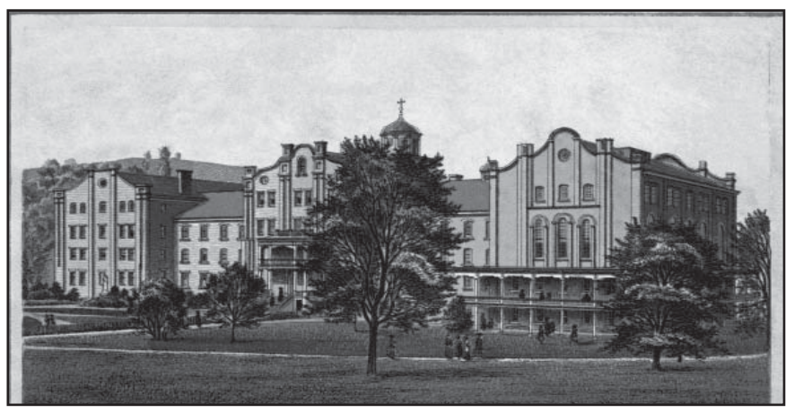
Mount de Chantal, circa 1883. From State Archives.