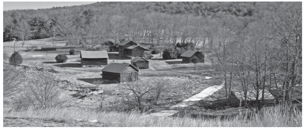
Pitsenbarger Farm, Pendleton County