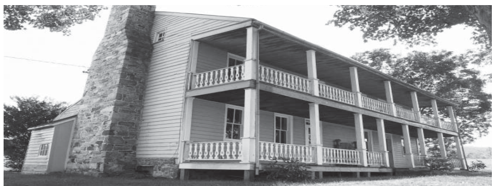
Hook's Tavern, Hampshire County