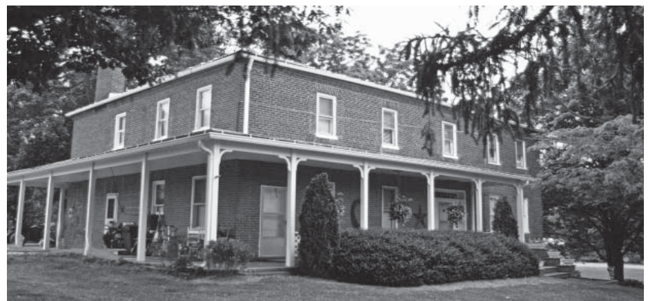
Hickory Grove, Hampshire County

The Luna Park Historic District sits on land once part of the large nineteenth century Glenwood Plantation located west of Charleston's commercial core. In the 1870s, the area became Charleston's "west end" when settlement was bolstered, first by the construction of a bridge over the Elk River, and later by the construction of a railroad bridge. The west end began to grow rapidly with new home construction and new industries. Much of the Glenwood Plantation became the Glenwood Addition. Located within the core of the proposed historic district was Luna Park, a popular amusement park that opened in 1912 and closed after a catastrophic fire in 1924. Original plans were to rebuild. However, that proved costly. Instead, the area became a "beautifully plotted subdivision" of "ideally located home sites." Though some houses predate this period, the majority of the houses within the district date from the 1920s and 1930s. By the start of World War II, the neighborhood was nearly built out with period-style architecture. The district is reflective of the small house movement where inexpen-