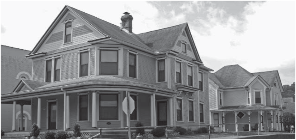
West Union Historic District, Doddridge County

1845. The town continued to grow, especially following the completion of the B&O Railroad from Harpers Ferry in 1856. West Union was incorporated by the West Virginia Legislature in 1881. By the late nineteenth and early twentieth centuries the oil and gas industry began to develop in Doddridge County. This very prosperous time for West Union coincides with the construction dates of many of the West Union homes. The architectural styles within the district are varied. However, collectively they represent the development and popularity of architectural styles from the late 19th to the early decades of the 20th century. (12/14/10)