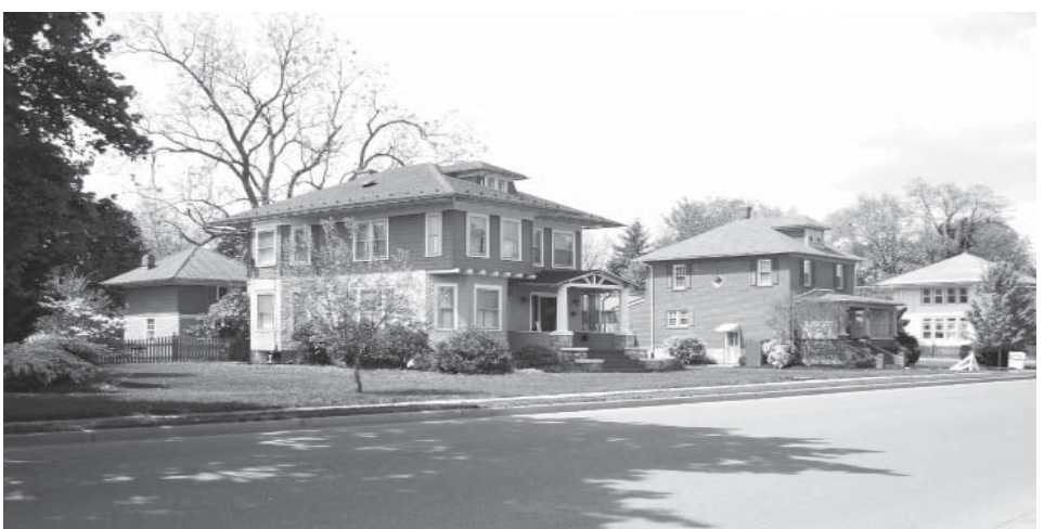
West Martinsburg Historic District, Berkeley County