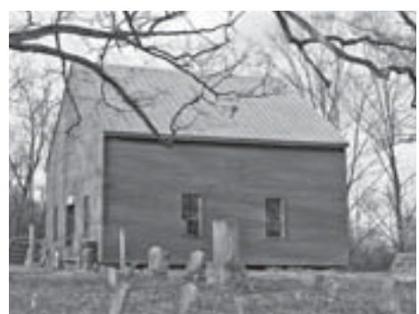
Old Pine Church, Hampshire County

Old Pine Church is located near Purgitsville, a small hamlet on the South Branch of Mill Creek that began as a small trading post. As the area became more populated and stable, Old Pine Church was constructed in 1838. The unadorned exterior, simple form, and construction method of the Old Pine Church reflect the early settlers' need to utilize easily accessible materials and construct a substantial building that would provide the necessary space needed to worship together. Old Pine Church is a significant example of the region's early religious architecture exhibiting log construction techniques of the earliest settlers as well as the simple design and form common to the early ecclesiastical buildings. (12/12/12)