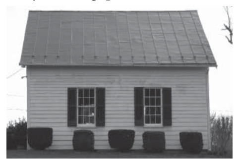
Capon Chapel, Hampshire County

Bucket Milker, Floy was a local dairy farming pioneer. (12/12/12)