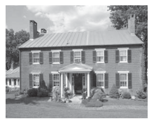
Valley View, Hampshire County

for more practical residential applications. The building's strict symmetry, both in plan and elevation, conforms to classical principles of order and organization. Though the building does not assume the form of the Greek temple as literally as other high-style examples, the substantial massing of the house is rooted in the same objectives of stability and formality. Valley View's central one-story portico and entrance entablature are definitive features of the style. Bricks used in construction of the house were fired nearby on the bank of the South Branch and the nine-inch brick walls were reinforced with hand-wrought iron angles. Nails were made by the local blacksmith and wood sills and joists were sawn by hand. (12/12/12)