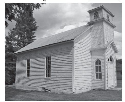
Pleasant Green Church, Pocahontas County

Pleasant Green Methodist Episcopal Church was built during this time. The church is reflective of the segregated society that developed after the Civil War. Its congregation was active through the 1970s. (12/12/12)