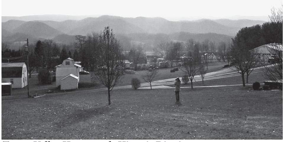
Tygart Valley Homesteads Historic District

Early in my tenure I learned that the state capital's historic downtown, often featured in popular publications and tourism brochures, was not listed in the National Register. Although we encountered skepticism and some opposition, I made it my goal to have downtown