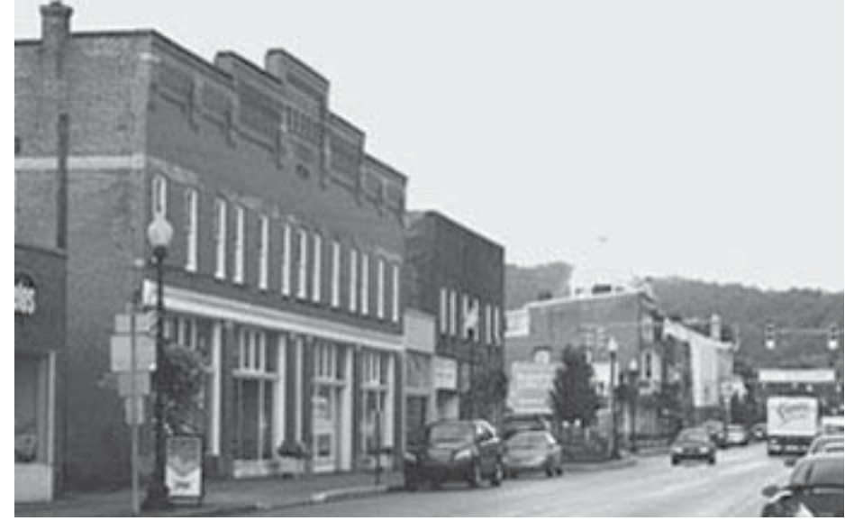
Downtown Buckhannon Historic District

Over the past decade, I have been invited into countless private homes to hear the history of the house over a cup of coffee. I have learned the history of many West Virginia communities during lunch at a local diner with volunteers, many of them members of local historical societies or landmark commissions who know the value of preserving the past for future generations and work tirelessly towards this goal.