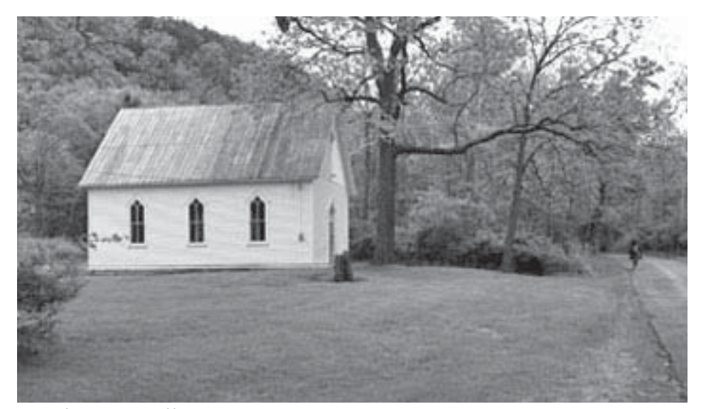
North River Mills Historic District

Through their efforts, we have listed various historic resources, such as Duffield's Depot (2007), a key supply depot for Union forces during the Civil War, and Elkins Riverside School (2009), significant for the important role it played in the education of the area's black youth in the first half of the 20th century. Volunteers also worked to list numerous districts, such as the Downtown Rowlesburg Historic District (2005), Downtown Buckhannon Historic District (2009), and the Harrisville Historic District (2011).