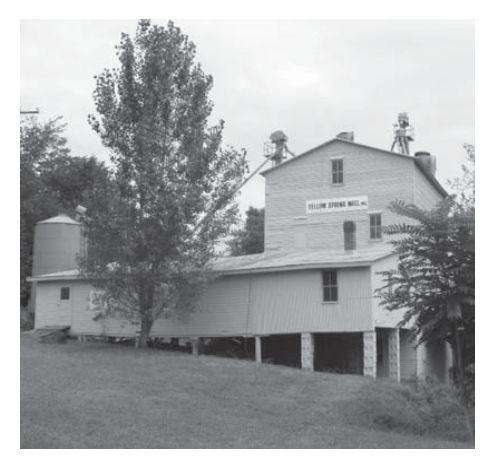
Yellow Spring Mill, Hampshire County

Today, the Gap Valley landscape defines this area and gives it its character as a rural historic district. The landscape reflects the traditional occupation of farming. The valley's architecture includes Bungalows, Ihouses, American Four Squares, Victorian, and Colonial Revival houses. (Determined eligible 12/29/2014)