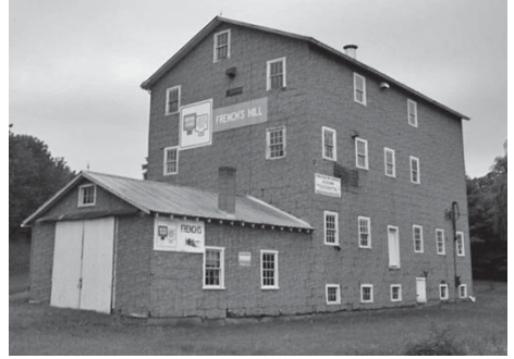
French's Mill, Hampshire County

Hebron Church, built in 1849 and changed in 1905 to add a metal roof and art glass windows, is significant for its local interpretation of the Greek