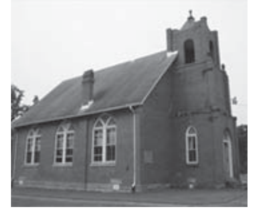
Bethel Presbyterian Church, Wood County

The congregation for this church was organized in 1845 and constructed the present building in 1904. When dedicated in 1905, a new handmade pulpit, built by a parishioner, and pump organ were used. These are still part of the church today. It is an excellent local example of the Gothic Revival style of architecture, having pointed arch windows, a steep gable roof, crenellation, and finials. An adjacent cemetery includes graves of delegates to the First Wheeling Convention in 1862, the Civil War, World War II, and notable local citizens (Listed 3/31/2014)