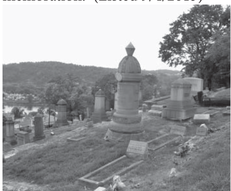
Mt. Woods Cemetery, Ohio County

Mt. Woods Cemetery is an excellent example of the "rural cemetery" movement which moved cemeteries to the city's outskirts, usually on hilltops with existing woods and impressive views. Such cemeteries were celebrated for their beauty and for their usefulness as city parks. The Mt. Woods Cemetery includes a collection of antebellum, Victorian-era, and early to mid-20th century funerary art, design and commemoration. (Listed 9/4/2013)