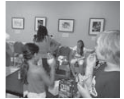
Students making butter