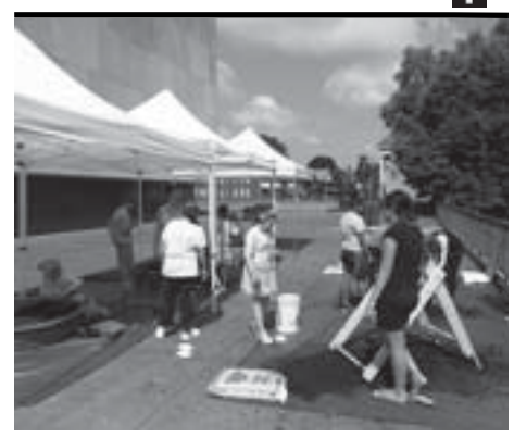
Students sift dirt from their "dig" site to see if artifacts can be found.

MountainPlex Properties, LLC received $25,221 to repair windows on the Hotel McCreery in Hinton.