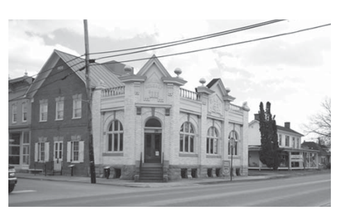
Beverly Historic District Boundary Increase, Randolph County.

When the Civil War broke out in 1861, Beverly held a strategic location on these transportation routes. Many buildings still extant today were used as hospitals or housing for soldiers. The Beverly Historic District represents a diverse range of residential and commercial architecture from the 18th through first half of the 20th century, from early settlement to post-World War II residential development. (Listed 12/16/14)