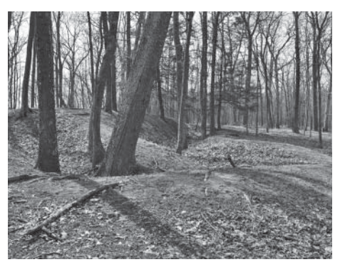
Fort Mill Ridge, Hampshire County

The redoubt and trenches retain excellent historic integrity and represent the defensive fortifications constructed by the Union army during the Civil War. Though adjusted for topography, the trenches were constructed following guidelines in the 1838 Treatise on Field Fortification written by D.H. Mahan, professor of military engineering. (Listed 1/22/14)