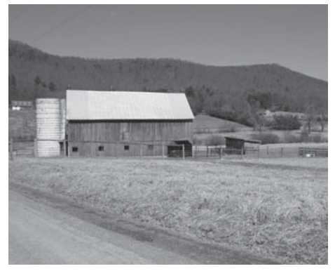
Gap Valley Historic District, Monroe County