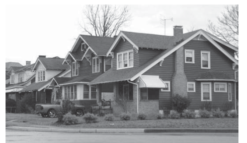
Charleston East End Historic District Boundary Increase, Kanawha County

This nomination increases the East End Historic District to