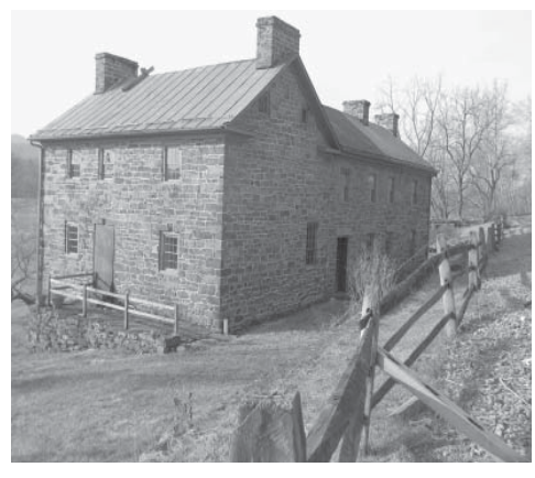
Nathaniel and Isaac Kuykendall House, Hampshire County