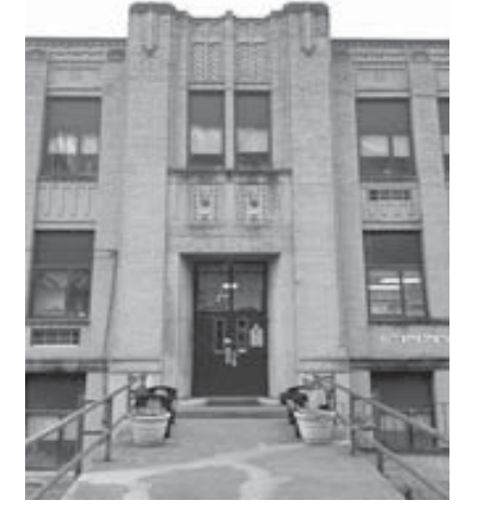
Whitesville School, Boone County

Following a 1929 fire that destroyed the original Whitesville School, the Sherman District Board of Education sold bonds to fund construction of a new school. They hired Charleston architects, Wysong, Bengston and Jones, to design the modern, Art Deco style school building. Construction began in September 1930 and was completed in time for the 1931-32 school year. The school is significant in southern West Virginia for its high-style Art Deco architecture. Elements of the style evident on the building include parallel lines, reeding and fluting, vertical bands of windows, inspiring murals, polychromatic effects, and low-relief geometric designs. (Listed 12/18/2013)