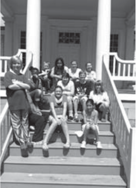
Class photo outside Craik - Patton House

The week ended with a trip to the Craik-Patton House (National Register, 1975) in Charleston. This trip helped to bring the week together by highlighting the different architecture seen in the house and in the reconstructed Ruffner log cabin along with showcasing the educational, and fun, side of historic preservation. Students learned late 1800's games and made butter. Seventeen students participated in the class.