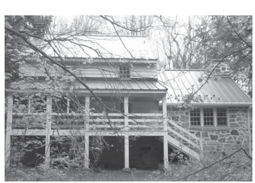
Old Hemlock, Preston County