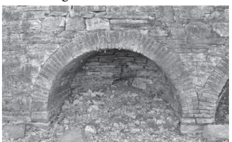
Potomac Mills, Jefferson County

The Potomac Mills complex includes the stone mill ruins and remains of the brick office or warehouse/dwelling, the battery of six stone lime kilns and small test kiln, and a single stone lime kiln on the